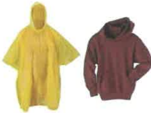
Poncho/Raincoat And Sweatshirt