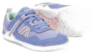
Sneakers and Socks Must be Worn Every Day

(If campers don't bring sneakers they may not be able to participate in certain activities)