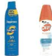
Sunscreen and Bug Spray