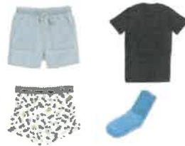
A Dry Change of Clothes (consider a plastic bag to separate wet/dry)