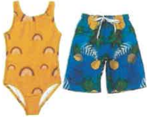
Swimsuit (Please be wearing swimsuits to camp on swim days) check children's breeze for info

Please pack a bag for your camper every day with the following items: