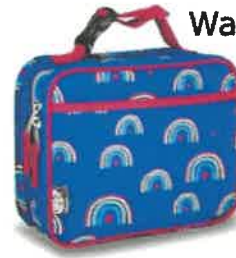
Lunch (If staying full day)